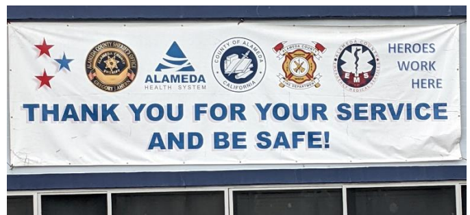
Figure 1, Large “Heroes Work Here” banner, put up by Sheriff Ahern to show support for Deputy Sheriffs. The banner is located on the front wall of the Eden Township Substation in San Leandro.

Recently Sheriff Gregory J. Ahern installed a large (20 feet by 5 feet) banner on the front wall at the Sheriff’s Office Substation in San Leandro. The Sheriff installed the banner to show support for Deputy Sheriffs during this stressful time (see Fig. 1 photo).